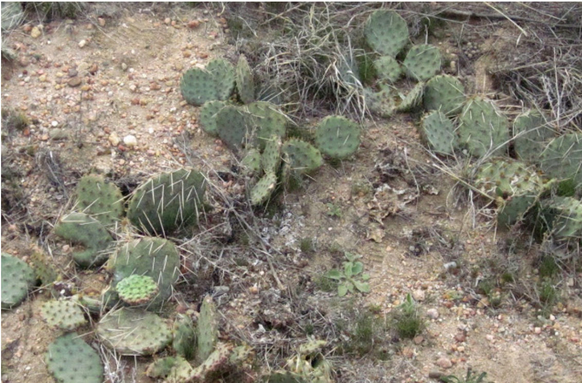
Prickly pear can become quite a nuisance in rangeland.

When it comes to controlling prickly pear, aside from keeping rangeland from being overgrazed and thus allowing the pear to flourish, there is help available from a rarely noticed Kansan, the North American cactus moth. There are two species that are possible in Kansas, Melitara dentata and Melitara prodenialis .