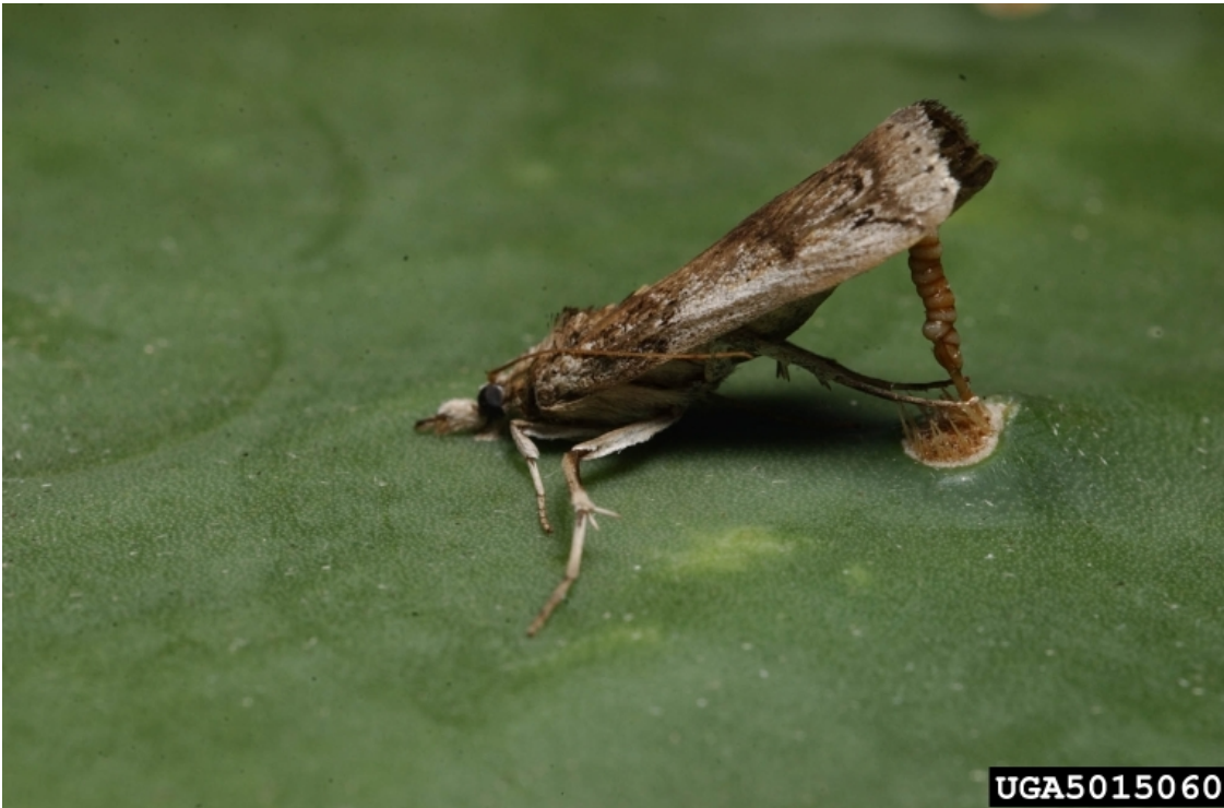
Female moths lay “egg sticks” on the spines of prickly.

This unassuming moth’s life depends upon the prickly pear. Female moths lay “egg sticks” on the spines of prickly pears during summer and early fall. Each stick can have anywhere from 20 to 100 eggs. Once these eggs hatch, the cactus moth caterpillars get to work boring into the prickly pear pads. Once inside, the caterpillars hollow out the pad and move on to a fresh one. This continues until winter when the larvae become less active. Feeding begins again the following spring and eventually new adults emerge around July to start the process all over again. Feeding by the caterpillars effectively destroys the prickly pear pads and, depending on the amount of feeding larvae, even the entire plant. Between 1939 and 1941 around Hays, Kansas, these moths were observed to reduce overabundant prickly pear stands by 50-75% or more. So, it turns out that this little moth can be quite effective at controlling nuisance prickly pear.