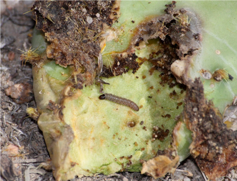
A young N. A. cactus moth larva, Melitara sp. , on a prickly pear pad.