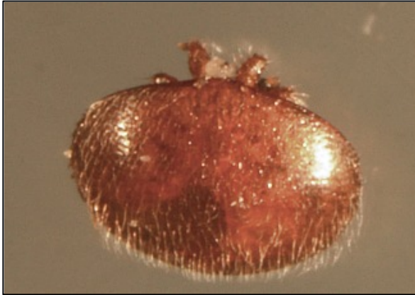
Varoa destructor in the beehive

Varoa destructor in beehives and suspected Thoracic mite damage in honeybees (inconclusive) - Kingmen county