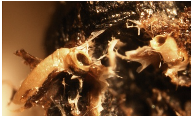
Melanized trachea of works honeybees vs healthy white trachea of drones

Blister beetles Nemognatha sp. around a vent in a chemical company building – Allen county