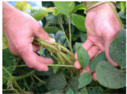
More Soybean Aphids

Emporia, KS on August 25, 2004