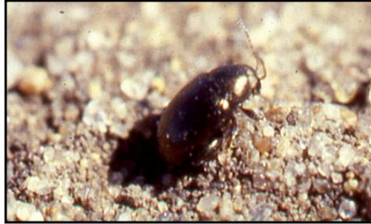
Figure 6 – Flea Beetle

The feeding of an individual flea beetle may seemingly be insignificant. Yet the collective feeding of many beetles can result in the death of newly emerged seedlings. It is therefore important to closely monitor plants for the presence of flea beetles and their feeding damage. As their name implies, they hop/jump, and may appear and disappear in the blink of an eye. Thus patience is required when inspecting for their presence. Most “garden insecticides” list flea beetles on their product labels. Repeated treatments may be required depending on the reoccurring presence of flea beetles, the ability of plants to outgrow the feeding damage, or a combination of both.