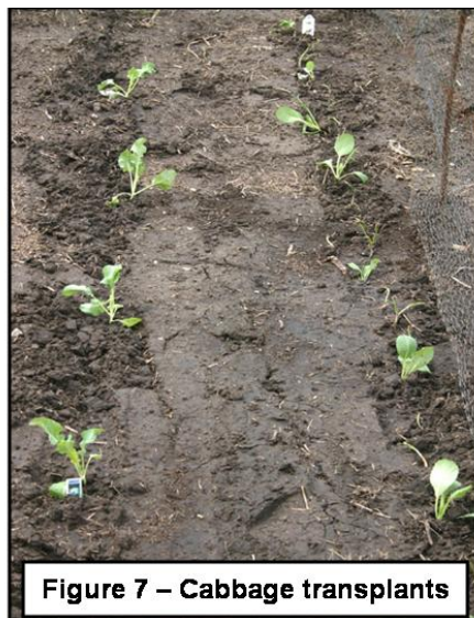
Figure 7 – Cabbage transplants

While early-season transplants have a head start on flea beetles, they are a tasty morsel for cutworms.