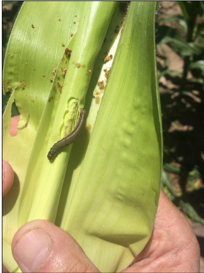
Fall armyworm feeding in corn