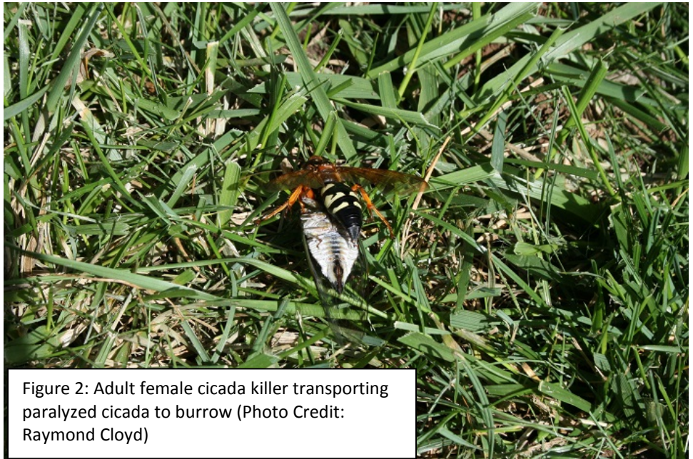
Figure 2: Adult female cicada killer transporting paralyzed cicada to burrow

Managing cicada killers in volleyball courts and baseball infields is more of a challenge because people with minimal clothing and exposed skin are diving and sliding onto the ground, which makes it difficult to recommend using an insecticide on a volleyball court. In these cases, the use of a geotextile fabric