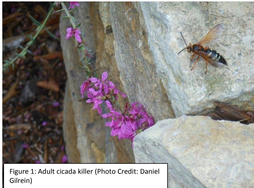
Figure 1: Adult cicada killer

Cicada killers are approximately 2.0 inches in length and black, with yellow-banded markings on the abdomen. The head and transparent wings are reddish brown (Figure 1). Cicada killers are not dangerous, but they are intimidating. These are ground-