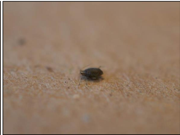
Early instar Bird cherry-oat aphid nymph