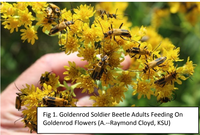
Fig 1. Goldenrod Soldier Beetle Adults Feeding On Goldenrod Flowers

Hordes of goldenrod soldier beetle, Chauliognathus pennsylvanicus , adults are now feeding on goldenrod ( Solidago spp.) (Figure 1) and other flowering plants. Adults are extremely abundant feeding on the flowers of wild onion ( Allium spp.) (Figure 2), and can also be seen feeding on linden trees ( Tilia spp.) in bloom. Adults, in fact, can be seen feeding and mating simultaneously. The goldenrod soldier beetle is common to the western and eastern portions of Kansas.