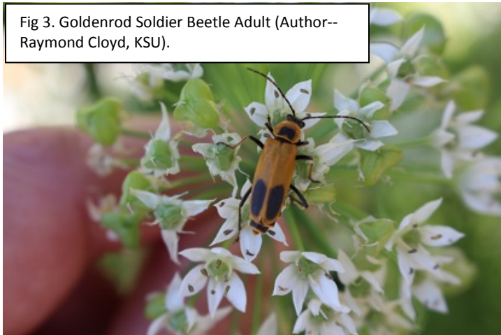
Fig 3. Goldenrod Soldier Beetle Adult (Author-- Raymond Cloyd, KSU).