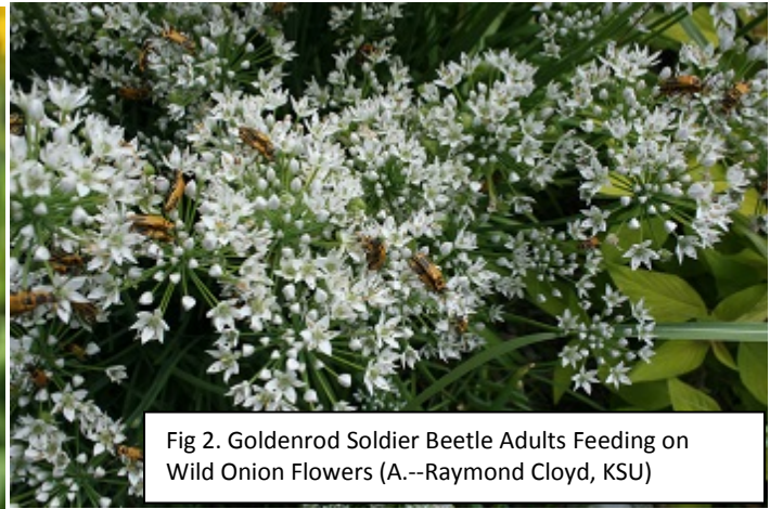
Fig 2. Goldenrod Soldier Beetle Adults Feeding on Wild Onion Flowers