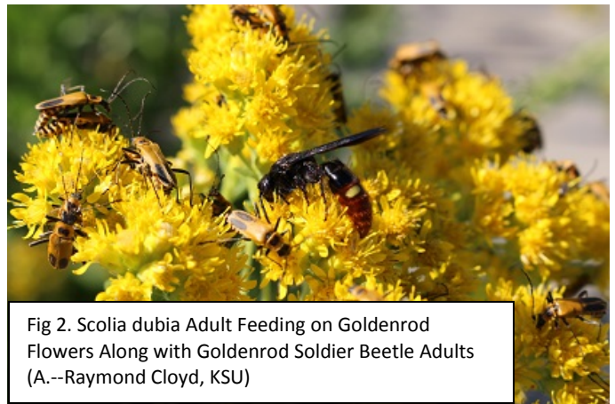
Fig 2. Scolia dubia Adult Feeding on Goldenrod Flowers Along with Goldenrod Soldier Beetle Adults (A.--Raymond Cloyd, KSU)