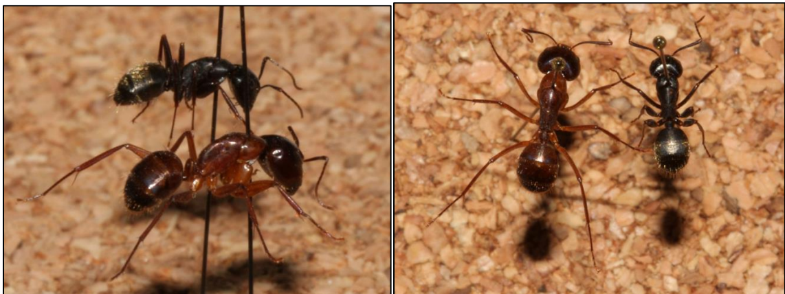
Showing red and black carpenter ants

If the swarm is determined to be ants, the next question is whether they are carpenter ants. Most of our ants are scavengers and therefore won't really cause a problem, other than being a nuisance. Carpenter ants are also scavengers; however, they do excavate and nest in soft woods including plywood, plasterboard, insulation, wood affected by water seepage, etc. Unlike termites, they do not consume wood and wood products. Carpenter ants range in size from ¼ inch to nearly 1 inch long and may be reddish to black in color, making them look very similar to many other ant species in Kansas. For many, the easiest characteristic to positively identify carpenter ants is the tiny ring of hairs on the very end of the abdomen, which may require a hand lens to see. Treatment for carpenter ants, as with most ants, is most effective by locating and treating the nest.