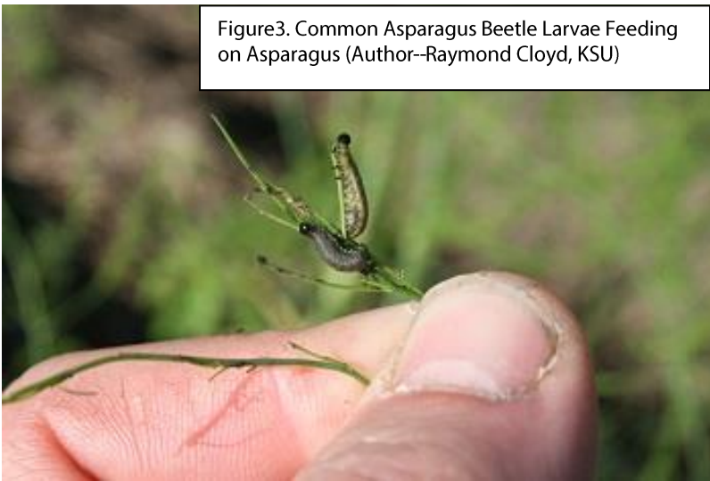
Figure3. Common Asparagus Beetle Larvae Feeding on Asparagus (Author--Raymond Cloyd, KSU)

adults emerge and start feeding. Common asparagus beetles overwinter underneath plant debris, loose bark, or hollow stems of old asparagus plants. The life cycle can be completed in eight-weeks. There are two generations in Kansas.