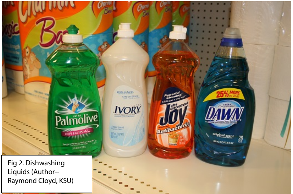
Fig 2. Dishwashing Liquids

There is a general misconception that any soap or laundry detergent can be used as an insecticide. This is not true. As already mentioned, only a few select soaps have insecticidal properties, but many common household soaps, laundry detergents, and dishwashing liquids including Palmolive®, Dawn®, Ivory®, and Joy® (Figure 2), which are unlabeled insecticides, may have some activity on soft-bodied insects when applied at a 1% or 2% aqueous solution. However, reliability is less predictable than soaps (potassium salts of fatty acids) that are formulated and registered as insecticides.