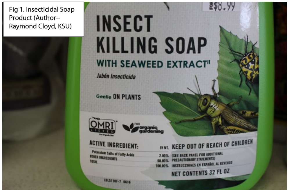
Fig 1. Insecticidal Soap Product (Author-- Raymond Cloyd, KSU)

Commercially available insecticidal soaps containing the active ingredient, potassium salts of fatty acids (Figure 1), are used against a variety of soft-bodied insect and mite pests including aphids, scales, mealybugs, thrips, whiteflies, and the twospotted spider mite, Tetranychus urticae. The young life stages (nymphs, larvae, or crawlers) are most susceptible to soap applications. Soaps have minimal activity on beetles and other hard-bodied insects although this is not always the case as certain soaps have been shown to kill hard-bodied insects such as cockroaches. Soaps are effective only when insects or mites mite activity as soap residues degrade rapidly; especially under sunlight (ultraviolet light).