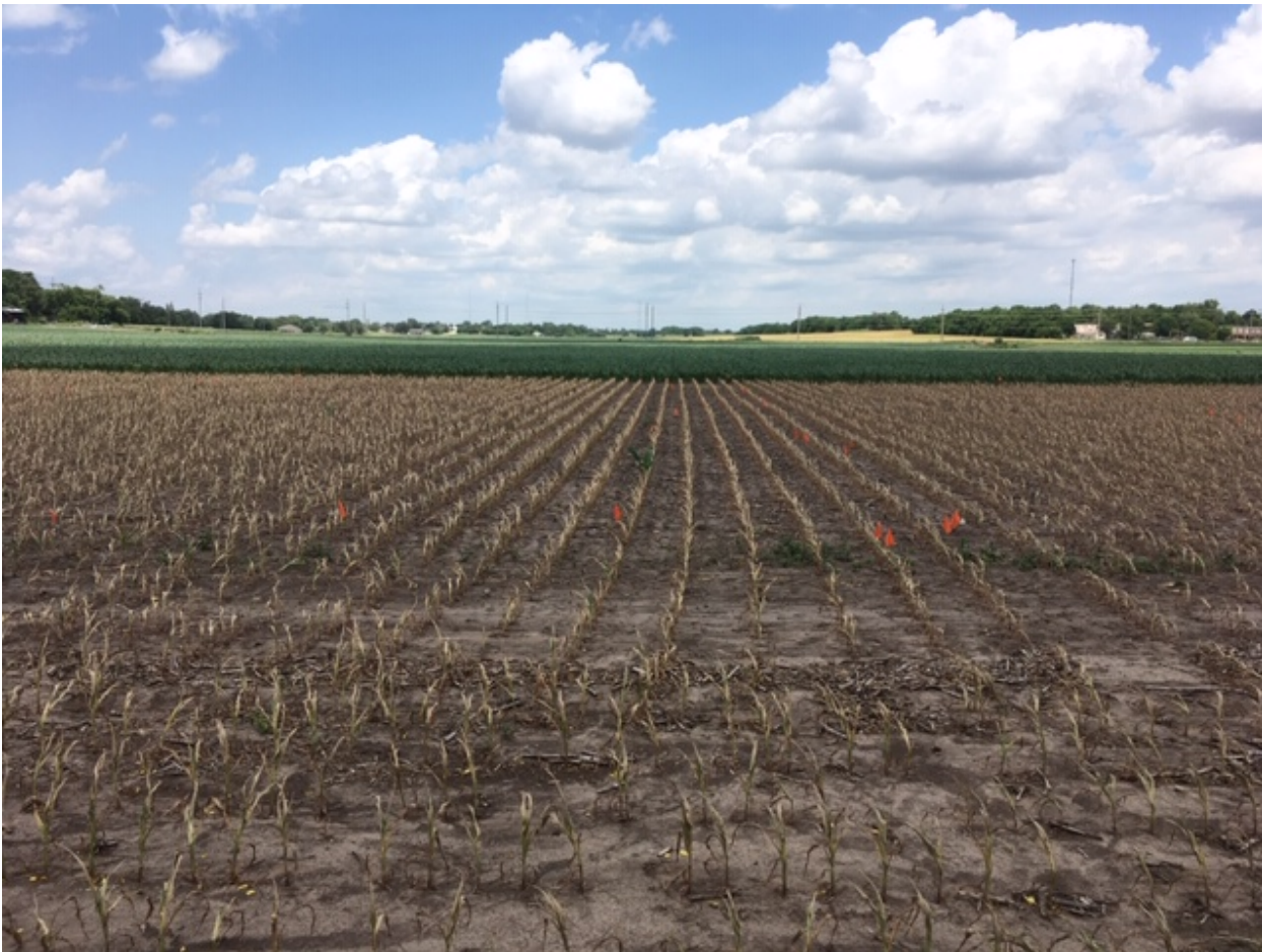
Figure 1 Non-Roundup Ready corn in the foreground, Roundup Ready corn in the background