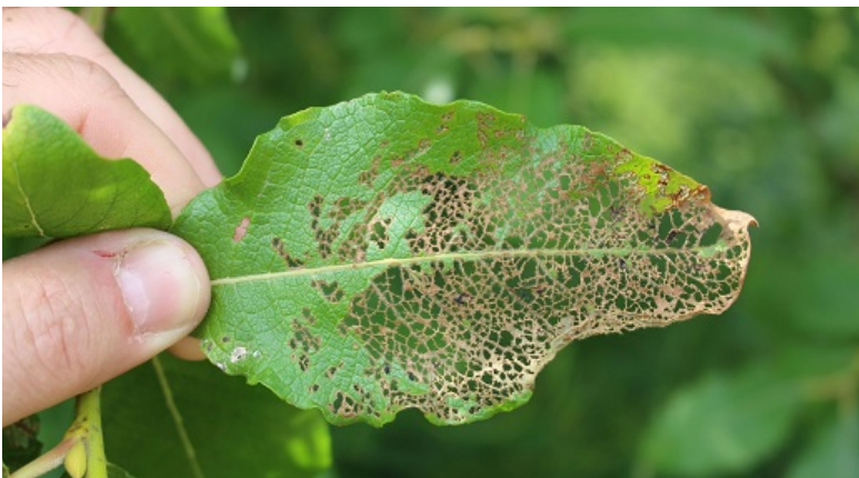
Fig 4. Japanese Beetle Adult Feeding Damage On Leaf (Auth--Raymond Cloyd, KSU)