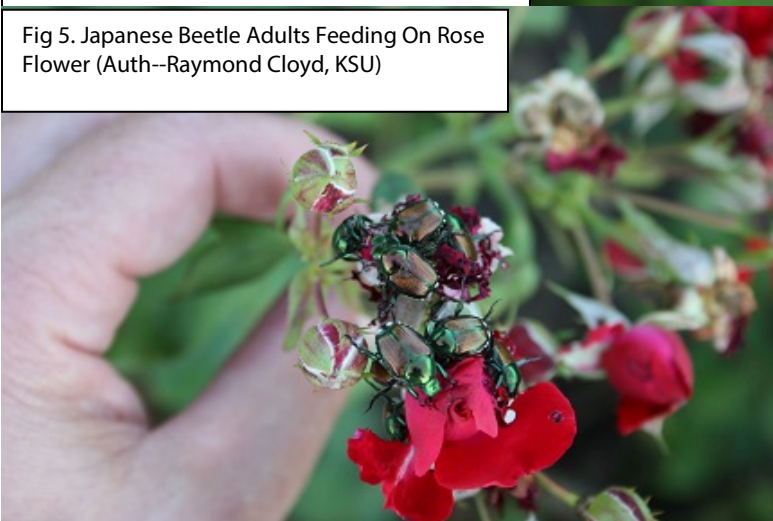
Fig 5. Japanese Beetle Adults Feeding On Rose Flower

feeding. Furthermore, Japanese beetle adults produce aggregation pheromones that attract males and females to the same feeding location. Adults can fly up to five miles to locate a host plant; however, they tend to only fly short distances to feed and for females to lay eggs.