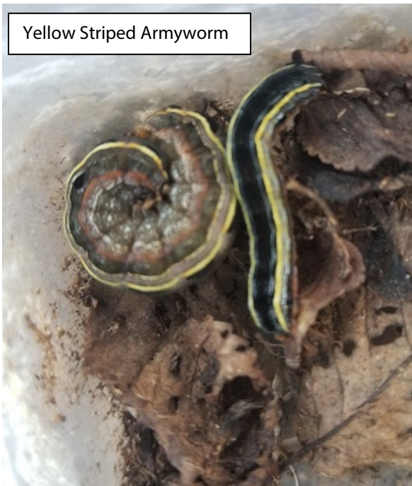
Yellow Striped Armyworm

Finally I spotted a mass of small caterpillars feeding on sunflowers in the garden. The sunflowers were not ones I plants and had come up as volunteer so I have decided to let the caterpillars eat on these plants. It is difficult to for me to identify the exact species from a picture, but they will turn into some sort of checkerspot butterfly.