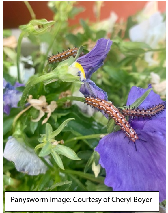
Pansyworm image: Courtesy of Cheryl Boyer

Then I found a few yellowstriped armyworm caterpillars feeding on some of my flowers. I picked them off as I did not want them to feed on those particular plants, but allowed them to feed elsewhere. These caterpillars turn into a somewhat drab grayish-brown moth.