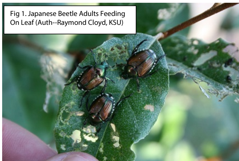
Fig 1. Japanese Beetle Adults Feeding On Leaf

Japanese beetle adults are 3/8 to 1/2 inch long, metallic green with coppery-brown wing covers, and approximately 14 tufts of white hair along the edge of the abdomen (Figure 1). Japanese beetle adults emerge from the soil and live up to 45 days feeding on plants over a four-to-six-week period. Adults feed on many horticultural plants including: trees, shrubs, vines, herbaceous annual and perennials, vegetables, fruits, and grapes (Figures 2 and 3). Plant placement in the landscape and the volatiles emitted by plants are factors that affect adult acceptance for