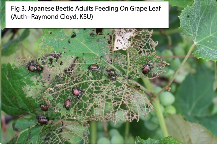
Fig 3. Japanese Beetle Adults Feeding On Grape Leaf (Auth--Raymond Cloyd, KSU)