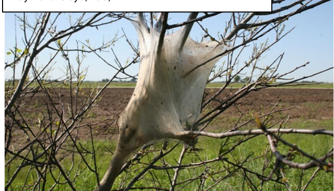
Fig 3. Eastern Tent Caterpillar (Auth--Raymond Cloyd, KSU)

Fig 2. Eastern Tent Caterpillar Tent or Nest (Auth--Raymond Cloyd, KSU)