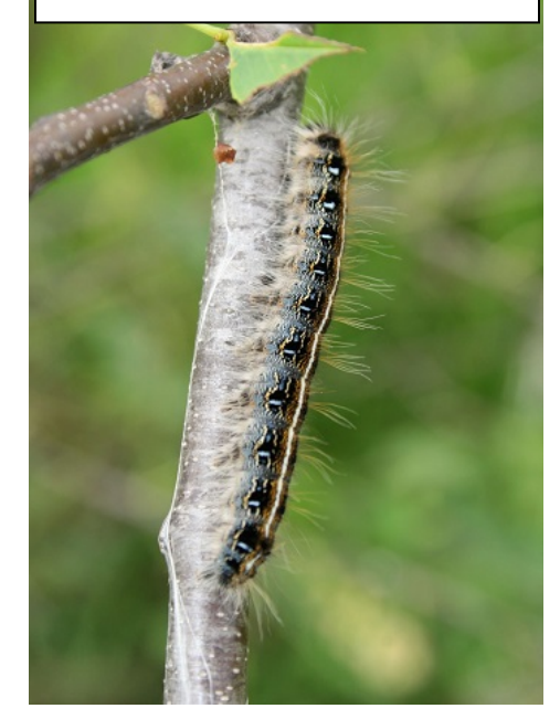
Fig 1. Eastern Tent Caterpillar Feeding On New Leaves (Auth--Raymond Cloyd, KSU)

Caterpillars are black with a distinct light stripe that extends the length of the back and there are blue markings on the side of the body (Figure 3). There are five instars (stages between each molt). Eastern tent caterpillar is one of our earliest caterpillar defoliators, feeding on newly-emerged leaves, which reduces the ability of trees and shrubs to produce food by means of photosynthesis. Although feeding damage may not directly kill a tree or shrub, a decrease in photosynthesis can predispose plants to secondary pests such as wood-boring insects. Leaf quality can influence tree and shrub