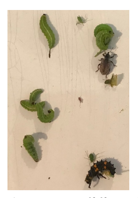
Figure 2 Mature Alfalfa weevil larvae, new adult AW plus aphids and Lady beetle larva (by Cayden Wyckoff)