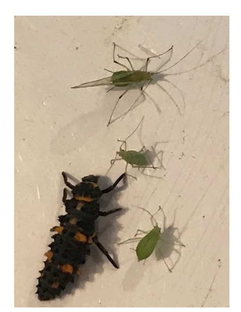
Figure 3 Aphids and lady beetle larvae (by Cayden Wyckoff)

Aphid populations, both pea, see Fig. 3, and cowpea, seemed to have dramatically declined also. This is probably a combination of the freezing temperatures coupled with a healthy population of lady beetle larvae, see Fig. 3, which have been voracious feeders on these aphids.