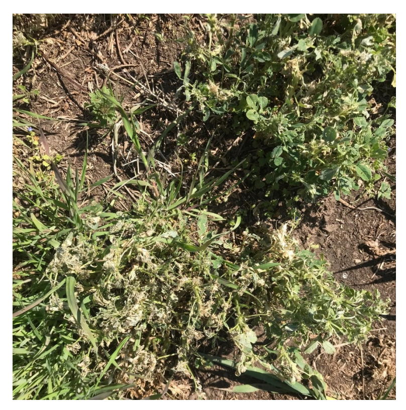
Figure 1 Alfalfa affected by the freeze

Much of the alfalfa throughout north central Kansas was significantly affected by last week's freezing temperatures, as previously noted. This is especially true of older, less robust stands, as indicated by the plants in the lower left portion of fig.1. Sampling these freeze-affected