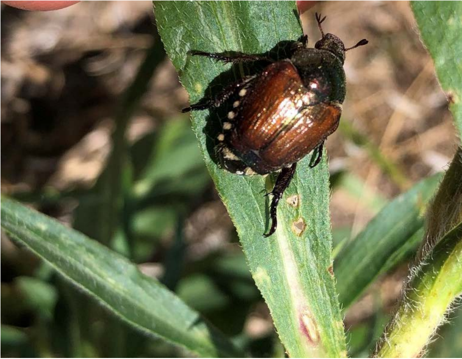
Japanese beetle