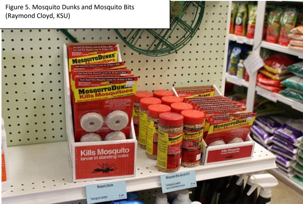
Figure 5. Mosquito Dunks and Mosquito Bits