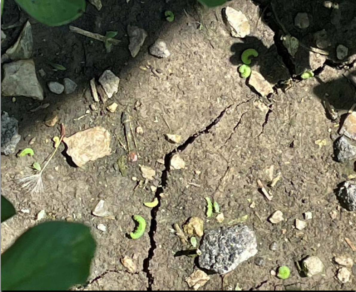
Figure 1: Dead Larvae