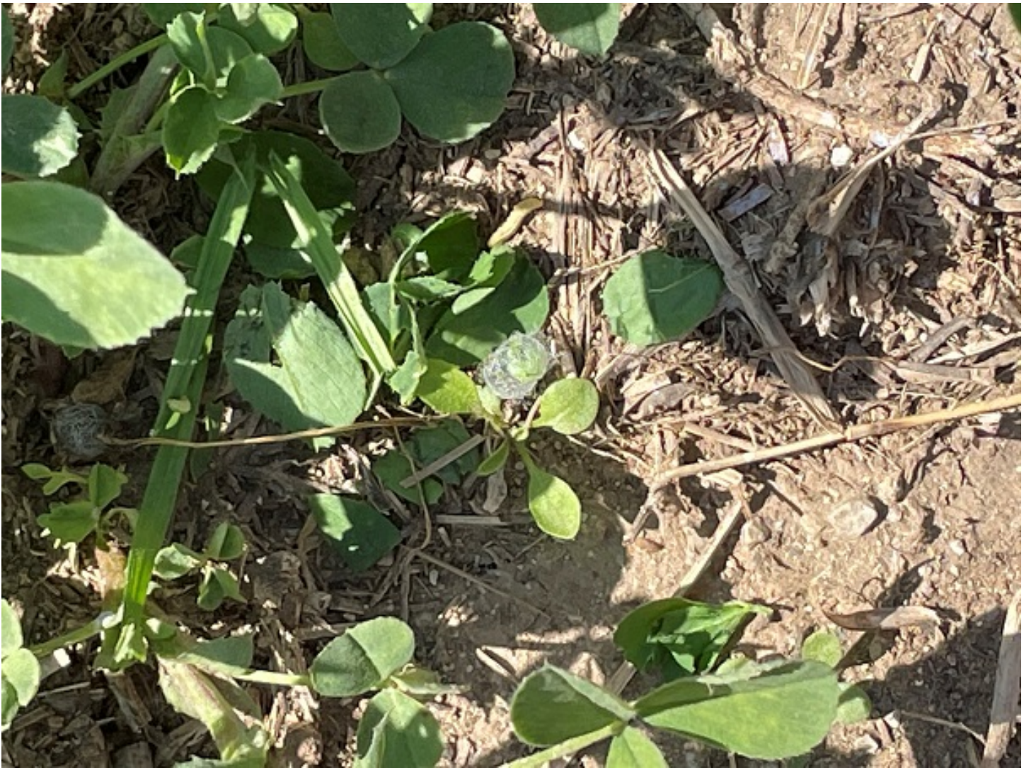
Figure 2: Alfalfa Weevil Pupa