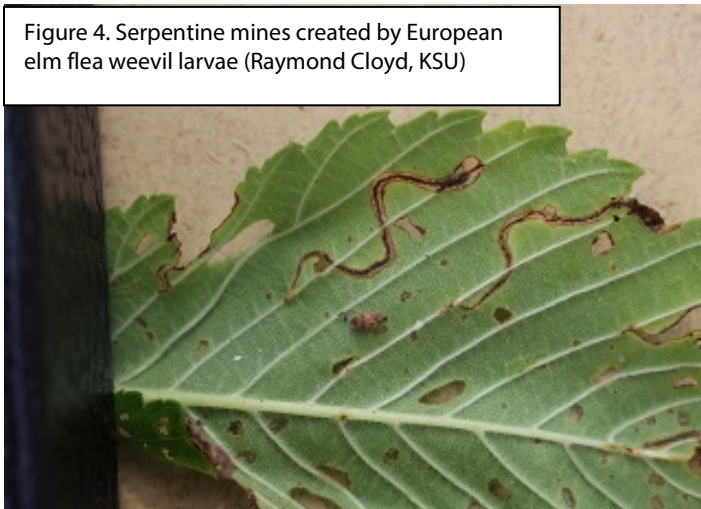
Figure 4. Serpentine mines created by European elm flea weevil larvae

in May, and after mating, females lay eggs in the large mid-veins of new leaves. Larvae emerge (eclose) from eggs and tunnel through the leaf as they feed, creating serpentine-like mines that enlarge as larvae mature (Figure 4). Larvae eventually transition into a pupal stage, and then adults emerge (eclose) from May through June. Adults primarily feed on leaf undersides creating small holes on young leaves (Figure 5). Feeding damage caused by larvae and adults will not kill an elm tree; however, extensive feeding damage may ruin the aesthetic appearance. Adults overwinter under loose bark and in leaf litter located under previously infested elm trees. There is one generation per year in Kansas. Nearly all elm species are susceptible to feeding by the European elm flea weevil; especially Siberian elms ( Ulmus pumila ) and certain elm hybrids with Asian parentage.