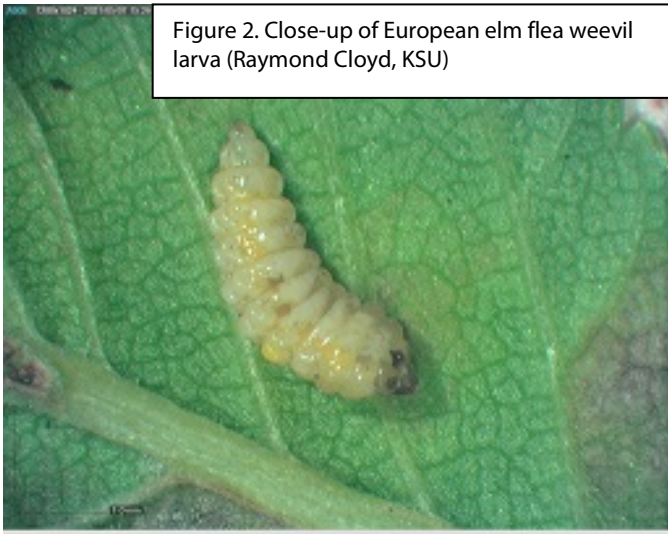
Figure 2. Close-up of European elm flea weevil larva