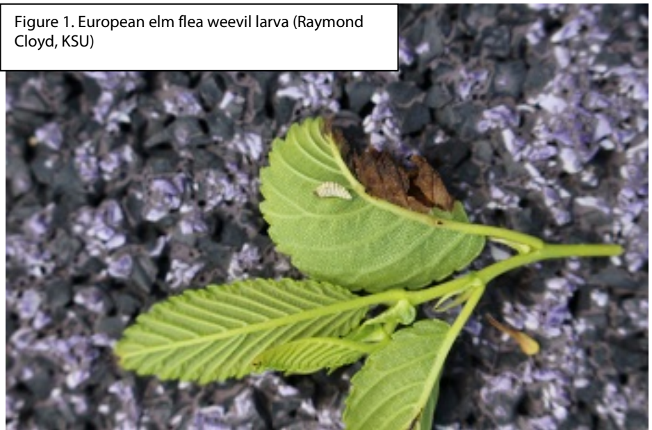
Figure 1. European elm flea weevil larva (Raymond Cloyd, KSU)

We are seeing damage on elm, Ulmus spp., trees caused by larvae of the European elm flea weevil, Orchestes alni . The larvae are approximately 4 mm (0.16 inches) in length, cream-colored, legless, wrinkled in appearance (Figures 1 and 2), and located in leaf mines. Adults, which will be present later in the growing season, are 3 mm (0.11 inches) long, red-brown, with black spots or markings on the abdomen (Figure 3). Their chewing mouthparts are located on the end of a snout-shaped structure that protrudes from the head. The hind legs are thickened and enlarged, which allows the adults to jump when disturbed. Adults are initially active