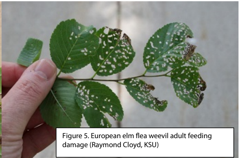
Figure 5. European elm flea weevil adult feeding damage (Raymond Cloyd, KSU)