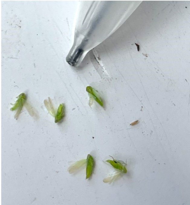
Figure 1. Adult potato leafhoppers