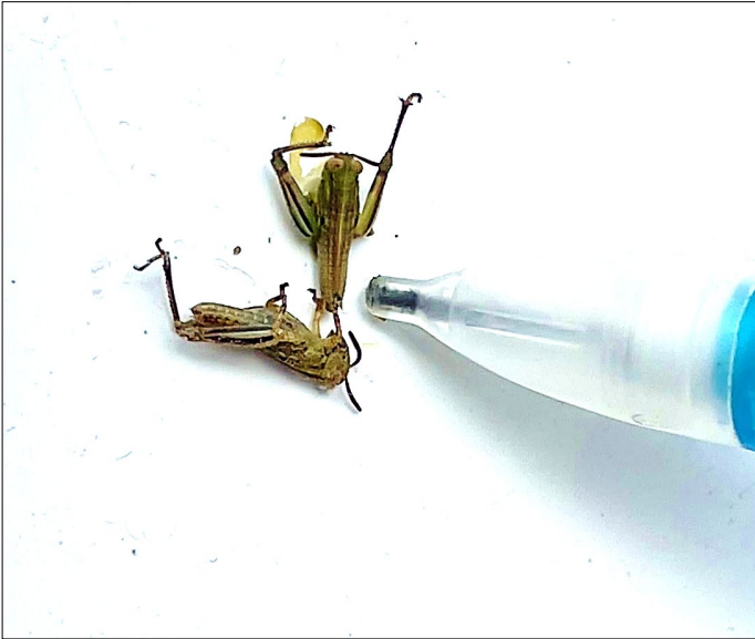
Figure 3. Grasshopper nymphs

Jeff Whitworth – Field Crops Entomologist