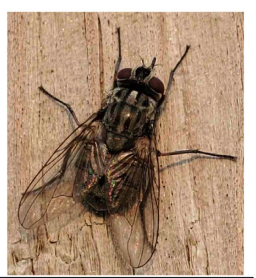
Figure 5: Stable flies on the legs of cattle and horses. Head upwards orientation and larger size is an easy way to distinguish between horn and stable flies