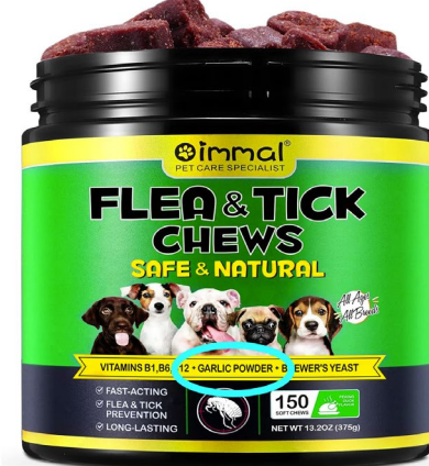
Figure 2: Garlic based tick and flea products available online. Many tick and flea control products labeled 'natural' are not safe or effective.