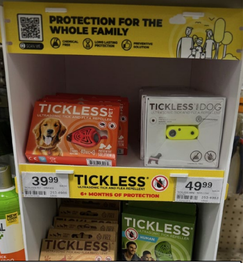
Figure 3: Ineffective ultrasonic tick deterrents can be found for sale both online and in store for dog and human use.

Warming weather also brings out flies and mosquitoes. Mosquitoes transmit a number of viruses and other disease containing disease agents like heartworm. Although unable to infect humans, infection in both cats and dogs is fairly common in Kansas. Monthly prophylaxis treatment of dogs and outdoor cats is essential. No treatment exists for heartworm infestations once established in cats and although treatment for dogs exists, it is both costly and not always effective. Viruses transmitted by mosquitoes are particularly damaging to horses so make sure you schedule your annual vaccinations soon! Cattle producers and horse owners should be on the lookout for stable flies earlier than usual. With warming temperatures, hay bales are the primary breeding location for stable flies and should be kept as dry as possible with as little mess (Figure 4). Stable flies are often found on the legs of cattle and horses with their heads pointing upwards towards the sky (Figure 5).