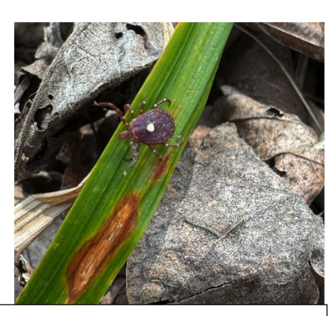
Figure 1: Adult male (left) and female (right) lone star tick in leaf litter. Female tick began climbing the blade of grass exhibiting host-seeking questing behavior.

protected by leaf litter and rocks. Overwintering is broken when temperatures warm and daylight hours increase. In warmer seasons, ticks can be seen crawling along the ground surface on the lookout for a host (Figure 1), a process known as questing. Tick drags and trappings conducted earlier in March found multiple species of ticks already out and active.