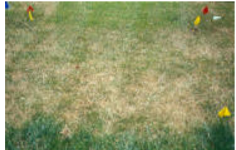
Figure 11 Dead area close-up

On the other hand, systemic insecticides provide control of billbugs by targeting the larval stages which feed on both foliar and root tissues. Larvae succumb after ingesting the systemic materials, the resultant being grass stands with a healthier/greener appearance (Figure 12).