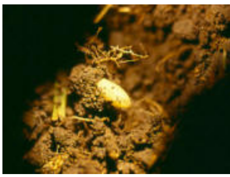
Figure 6 Pupa