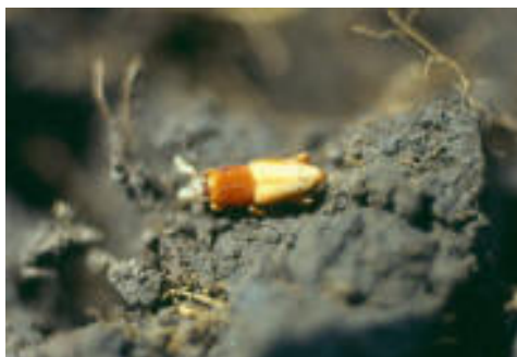
Figure 8 Callow adult