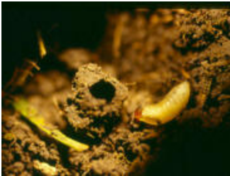
Figure 5 Earthen cocoon

Mature larvae form earthen cocoons (Figure 5) inside of which they pupate (Figure 6). Upon close examination of the pupa, certain features of the future beetle can be discerned, notably their “snout” and legs (Figure 7). A newly-emerged adult (referred to as a callow adult due to its light coloration) (Figure 8) will soon darken as it’s cuticle hardens (Figure 9). These adults will feed throughout the remainder of the summer, thus accumulating food reserves to sustain them through the overwintering phase.