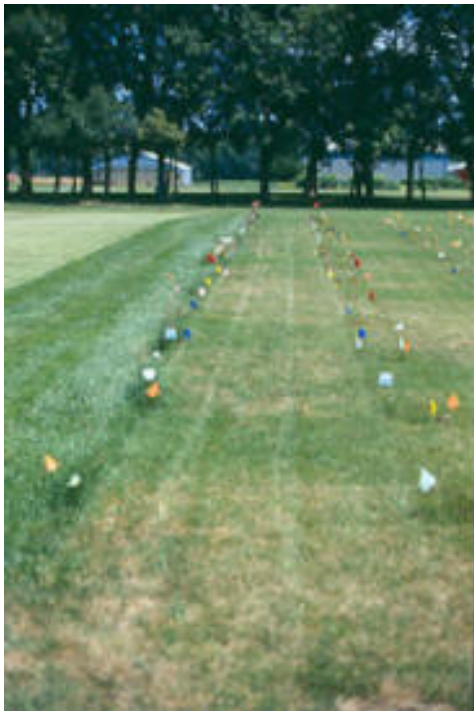
Figure 10 Thinned/dead areas

Not every bluegrass lawn or turf situation experiences billbug damage. It may be due to the absence of billbugs in those particular areas. Or possibly, billbug populations are not of sufficient size to cause noticeable damage (especially) to high maintenance lawns which are well watered and appropriately fertilized. Where, however, billbugs cause damage on a frequent (if not yearly basis), preventative insecticide applications may be warranted. If the insecticide (selected for use) is a contact "adulticide", it is essential to detect the actual billbug migration as it moves into turf areas. Billbugs must be eliminated before eggs are laid. Once eggs have been deposited, newly emerging larvae are protected within the stems upon which they feed. And by the time that they exit the stems and immediately enter the soil, insecticide residues (if any) provide little kill ---- resultant being that grass stands are thinned out/killed (Figure 10), light areas, and Figure 11, close-up of damage).