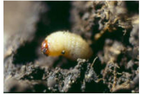
Figure 4 Larva close-up

Mature larvae form earthen cocoons (Figure 5) inside of which they pupate (Figure 6). Upon close examination of the pupa, certain features of the future beetle can be discerned, notably their “snout” and legs (Figure 7). A newly-emerged adult (referred to as a callow adult due to its light coloration) (Figure 8) will soon darken as it’s cuticle hardens (Figure 9). These adults will feed throughout the remainder of the summer, thus accumulating food reserves to sustain them through the overwintering phase.