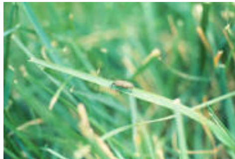
Figure 1 Bluegrass billbug

Despite being called “billbugs”, billbugs are beetles ---- specifically members of the family Curculionidae (commonly referred to as snout beetles and true weevils). In Kansas, the most frequently encountered billbug turf pest is the bluegrass billbug (Figure 1, note “snout”). Bluegrass billbugs are associated with cool season grasses, most commonly its namesake, bluegrass. Bluegrass is a highly desired type of turf because of its color and fine, thin bladed appearance. However, because bluegrasses prefer a cooler and moist climate, they struggle through the dry hot Kansas summers. Stressed lawns are thus especially susceptible to billbug damage.