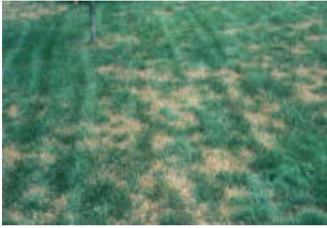
Figure 2 Dead turf

appear (Figure 2). At this point in time, most larvae are fully grown and easily found when digging into “dead spots” (Figure 3). The larvae are white, plump and legless (Figure 4).