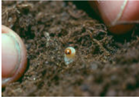
Figure 3 Billbug larva