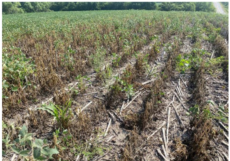
Figure 1. Soybean field with damage by soybean gall midge.

The Soybean Gall Midge ( Resseliella maxima ) was first observed in Nebraska in 2011 but was not officially described as a new species until 2018 when this tiny fly established itself as an emerging pest of soybeans in South Dakota, Nebraska, Minnesota, and Iowa. New infestations have been documented every year since and its range has expanded into Missouri. Soybean gall midge has been documented in Nebraska along the Kansas border as recently as 2021. This pest should be actively scouted for during the growing season, especially in counties along the Nebraska border.