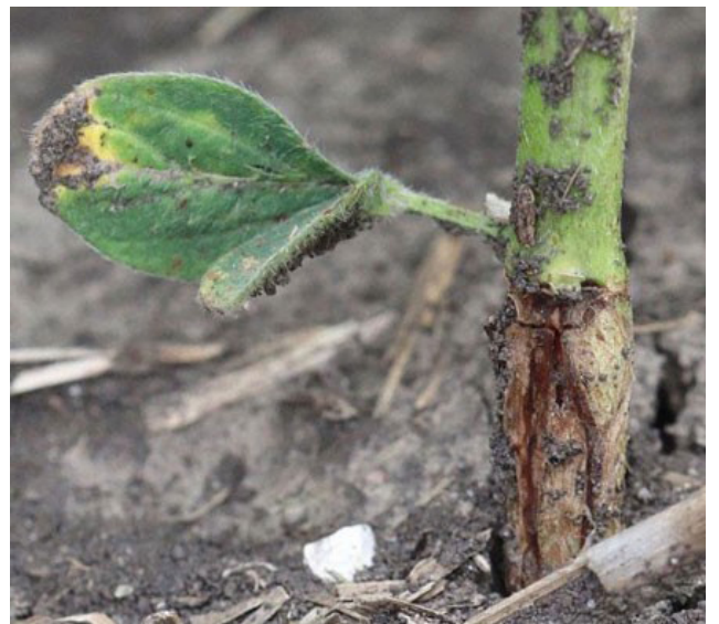
Figure 5. Darkening and swelling of stem..