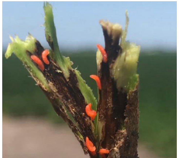
Figure 3. Soybean gall midge larvae (Justin McMechan, Univ. of Nebraska).

Larvae: small, legless, maggots that are clear to white-colored when young but turn bright orange when mature (Figure 3).