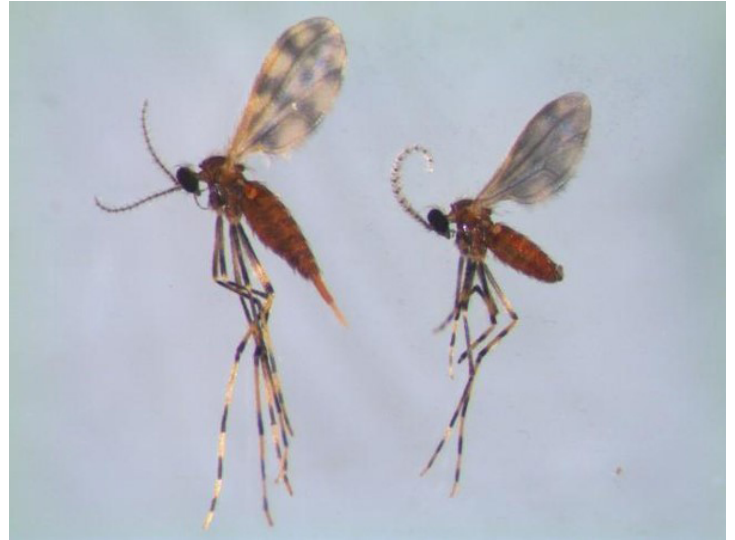
Figure 2. Adult soybean gall midge.

Adults: tiny (2-3mm), delicate flies with an orange abdomen, slender bodies and mottled wings. Long legs are banded with alternating light and dark markings (Figure 2).