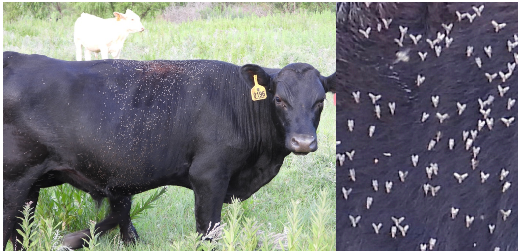
Figure 1. Horn flies on the back of cattle feeding in groups with the head down facing the ground.

Cattle will often show signs of fly worry such as throwing the head back to disrupt flies and attempting to lick the affected area. As adults, horn flies stay on the animal throughout the day with females only leaving temporarily to lay eggs. Flies show animal-animal preferences with some animals carrying higher fly burdens than. The cause for this variation is not known. High levels of pesticide resistance are becoming common and are likely to accelerate in the future. Even low numbers of horn flies can cause economic losses in stocker calves while mature animals to be able to withstand about 200-300 flies per animal without negative impacts.