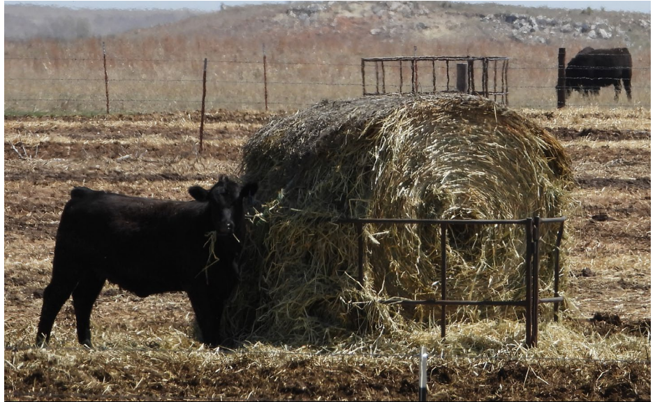
Figure 2. Hay waste generated by hay bales is one of the primary breeding sites for stable flies. Over 50 000 flies can be produced from a single standing round bale each week.

Stable flies are the first to emerge often seen in early spring. Populations tend to diminish over the peak summer period when temperatures are high and lower levels of rainfall occur. The impact of stable flies is often underestimated, if you see an animal 5 times a day and it has 5-10 flies each time, what you actually have is 25-55 flies! Stable flies are bigger than horn flies and are primarily found on the legs (particularly front) of animals with a 'head up' orientation (Figure 3). They can also be seen on the neck and belly of animals.