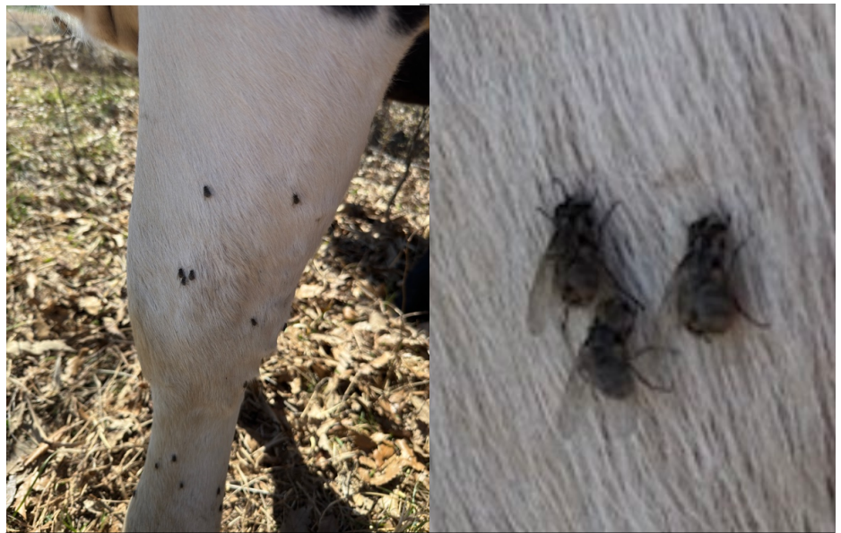
Figure 3. Stable flies feeding on the legs with their head pointing up towards the sky.