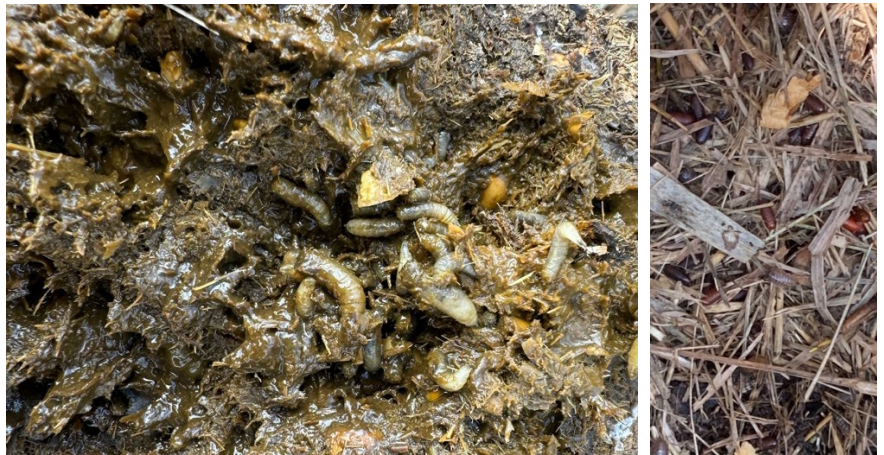
Figure 4: Muscid fly larva (maggots) in manure contaminated areas (left) and reddish brown pupa (right) collected from the base of a hay bale.

Chemical control: A number of chemical control options in various formations exist and historically have been the mainstay of fly control. These are most effective for horn as they are in continuous contact with the host. They are not very effective for stable fly control. To minimize the rate at which resistance develops, rotate chemical classes annually. In year 1 use only pyrethroid based products, Year 2: organophosphate based products and Year 3: macrocyclic lactone (pour on like Cydectin or Tri Zap tag). Cydectin labels itself as dung beetle safe potentially because it is a topical treatment. Potential impacts on dung beetles need to be weighed up against resistance developing in fly populations.