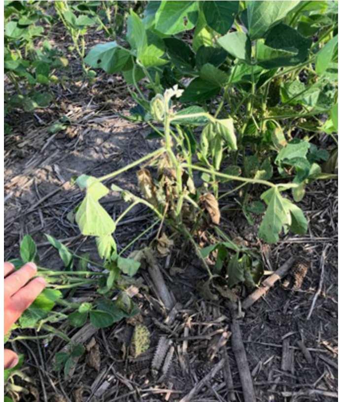
Figure 4. Wilting soybean plant from gall midge infestation (Justin McMechan, Univ. of Nebraska).